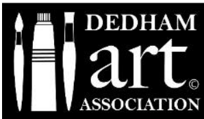
Exhibit Policy for Dedham Art Association (as of 06-24-2022)