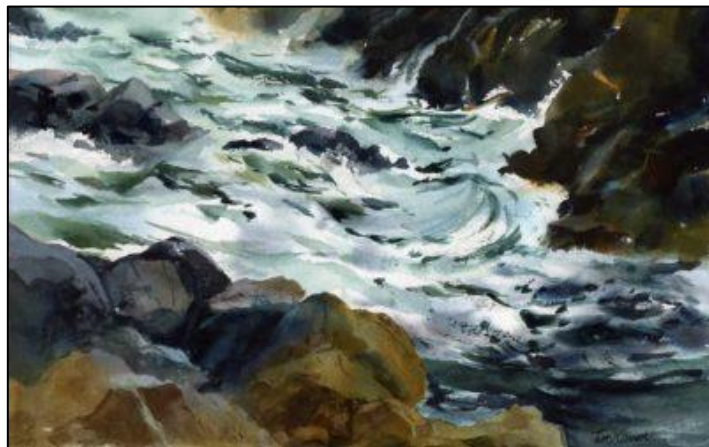
“Green, Gold, Grey” Watercolor by Tony Conner

A native of Winchester, Virginia, Tony currently works from his studio in Bennington, Vermont. According to Tony, “What attracts me to a particular scene has to do with the pattern of individual objects, contrasts of color, value, or intensity and, most of all, the quality of light at a particular moment.” ... “Watercolor is my main medium of choice. It is truly the medium of light since much of its beauty and character result from the interaction of transparent color and the light that passes through, from paper to eye.”