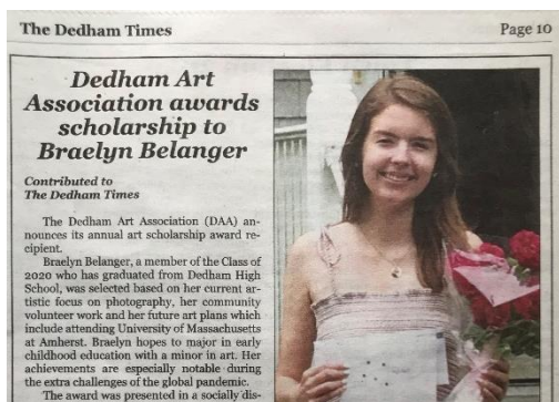
Scholarship Recipient 2020

Please consider adding an extra donation to your membership dues to support the fund for this year. This will take the place of drawings that we hold at in-person meetings.