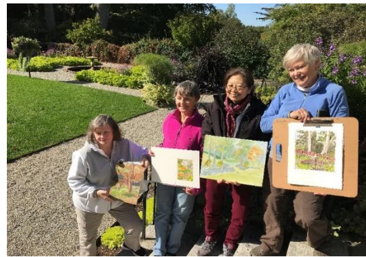
Bradley Plein Air Outing, 2017