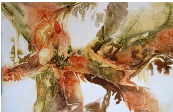
"Rainforest" watercolor by Nan Daly June 2019 Members' Exhibit First Place Award

We are transforming our annual June Members' Exhibit and Soiree! Instead of a physical exhibit, we are going to hold a virtual exhibit on our website. A special online gallery will be set up in addition to our normal art slide show.