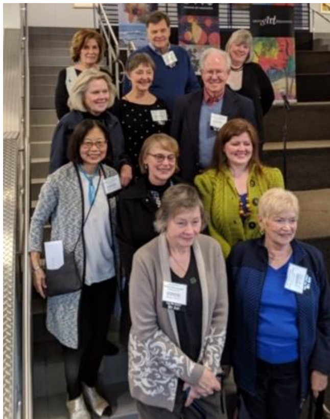
Five Stars Regional Art Exhibit Opening Reception, April, 2019

We sponsored our first-ever regional art exhibit, the Five Stars show, at the Mosesian Art Center.