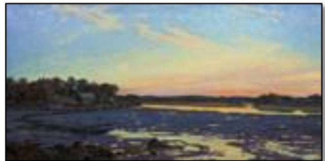
“Dream Crossed Twilight,” oil painting by David Curtis

David’s website: https://www.davidpcurtis.com/