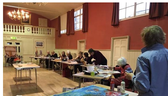
Dedham Art Society, Dedham, England

Since then we have exchanged emails to learn more about each other's groups and have exchanged well wishes between the two boards. It's amazing that we have so much in common and hope the exchange continues!