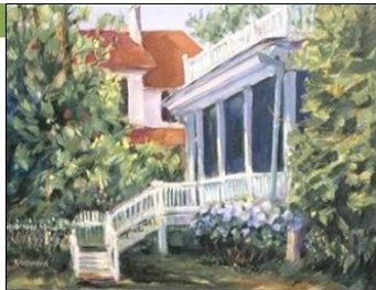
"Back Porch" oil painting by Nan Richmond