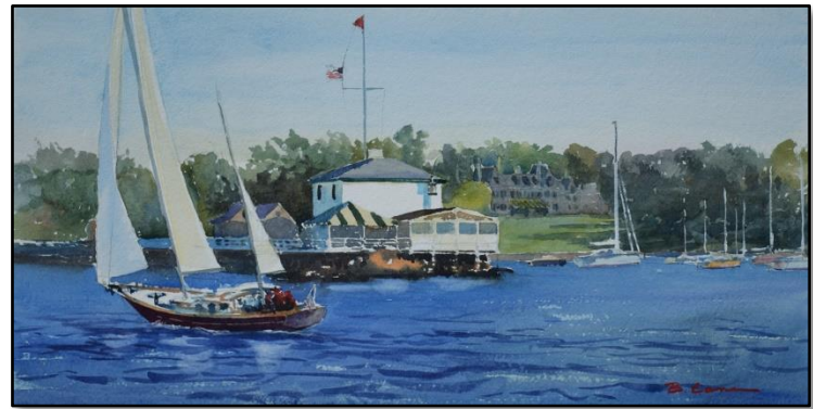
"Dueling Pennants" watercolor by Bill Lane

Bill enjoys plein air painting whenever possible, but New England winters, which make for frozen watercolors, tend to keep him indoors.