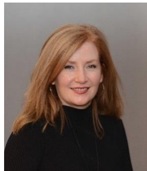
→ Catherine Perrone Web Exhibits