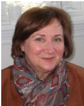
→ Robin Western Programs