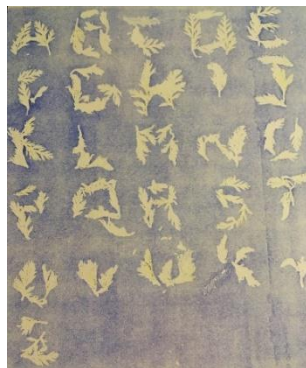
Real carrot greens on left; print on right

“I love color, and try as I might, cannot tone it down or turn it off. I aim to make people smile