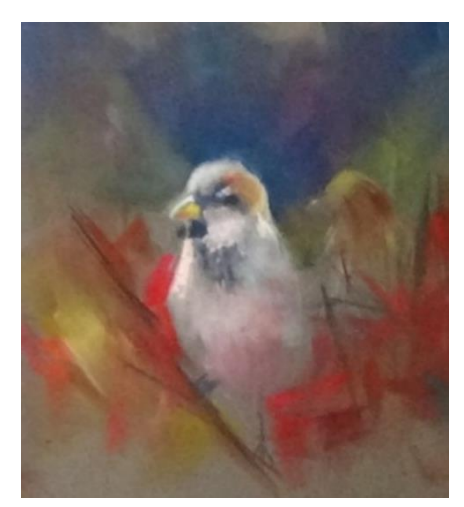
Detail of pastel demonstration of birds by Lisa Regopoulos