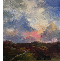
Block Island Sky oil by Barbara Reynolds