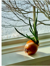
Berkshire Onion