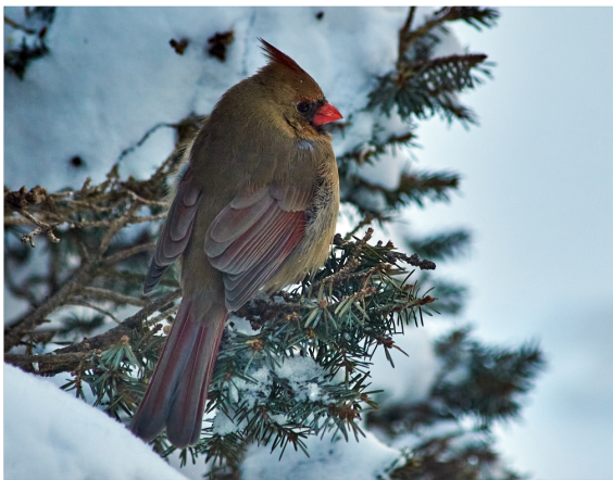
Shelter from the Storm

For about a decade I enjoyed learning plein air oil painting. Though I ultimately returned to focus solely on photography, lessons that I learned regarding colors and their interactions, framing a scene, composition, and simplification apply equally well in either medium. The attraction of photography for me is in capturing a moment of time that will never be repeated in exactly that same way ever again. Coupling still photography