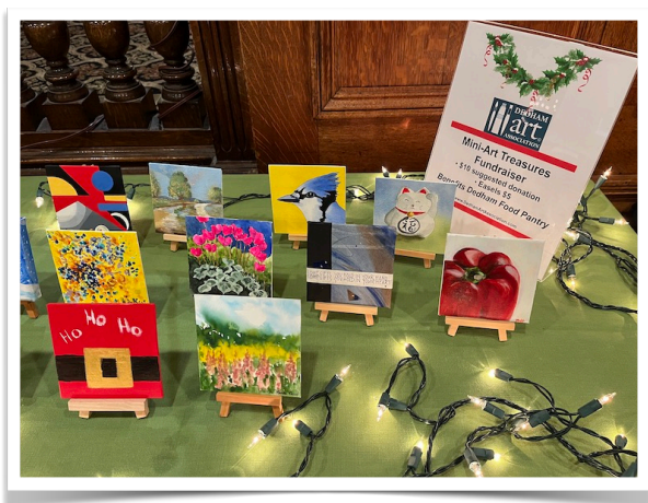
2022 Art Swap

“I have always had an interest in art, but I never pursued it until I retired. I find that making art is relaxing, and I enjoy the sense of flow and freedom that it gives me. I have only been painting for about eight years.