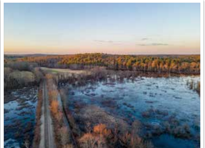
Track & Field color

I've very much enjoyed the opportunities to exhibit with the Dedham Art Association, as well as contribute some of my various talents on several volunteer projects!”