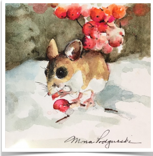
Previous Miniature Art by Mona Podgurski

Celebrate with art! Clean out clutter! You are invited to our Holiday Gathering on MONDAY , December 4, 2023 (not our usual Tuesday). Miniature 4" x 4" substrates have been distributed to members to create original miniature at home that will be randomly exchanged with other