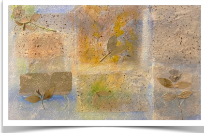
June Transparency, collage by Adele Rothman