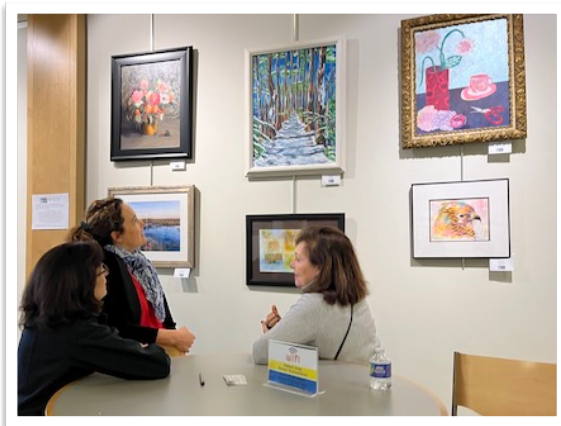
Members enjoying the art exhibit