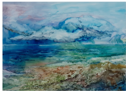
Wild One, watercolor on Upo by Inga Dankers