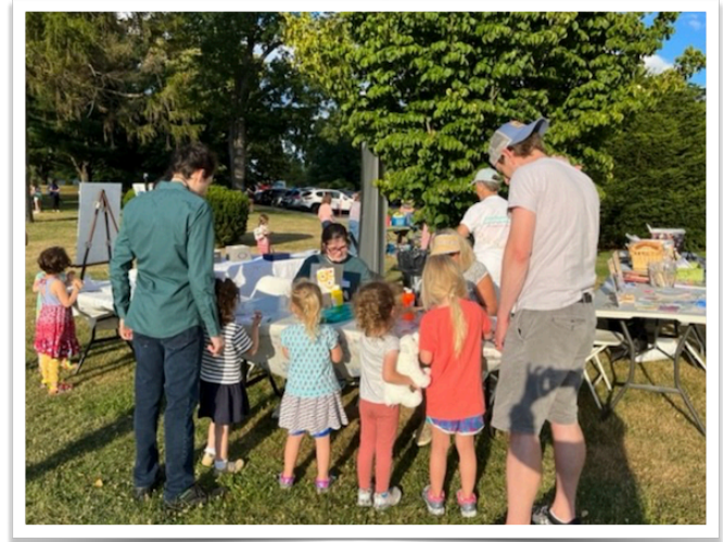
Children working on an art project at Arts@Endicott in 2022